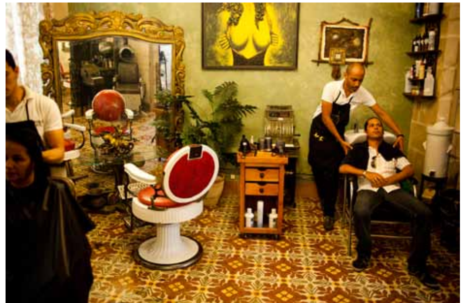
A hair salon has been installed in an apartment in Old Havana.