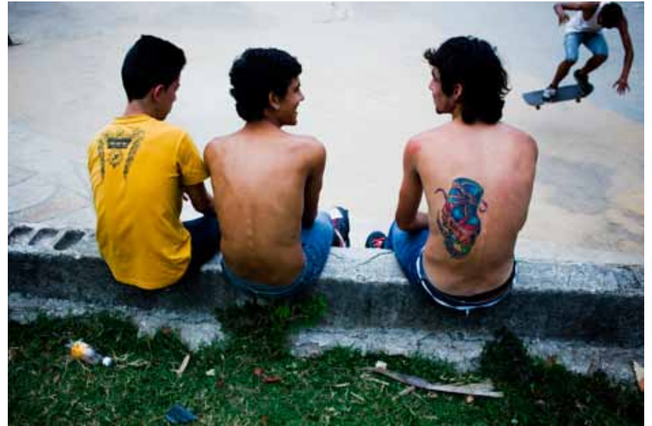
The only skate park in Cuba, the young come to train after work or on weekends.