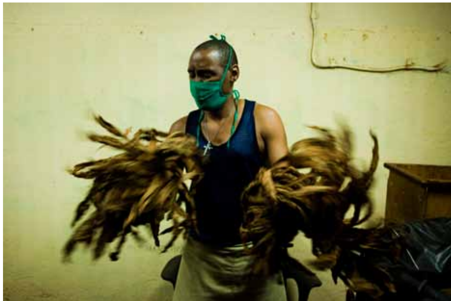
In the tobacco factory H Upmann. Sorting tobacco leaves just arrived at the factory.