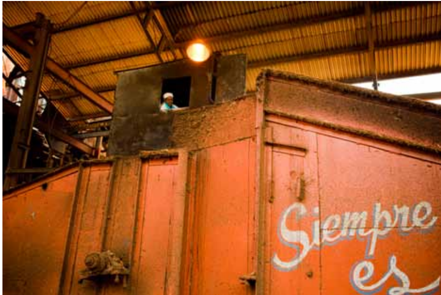
The sugar mill Rabi Jesus is one of the largest sugar plants in Cuba.