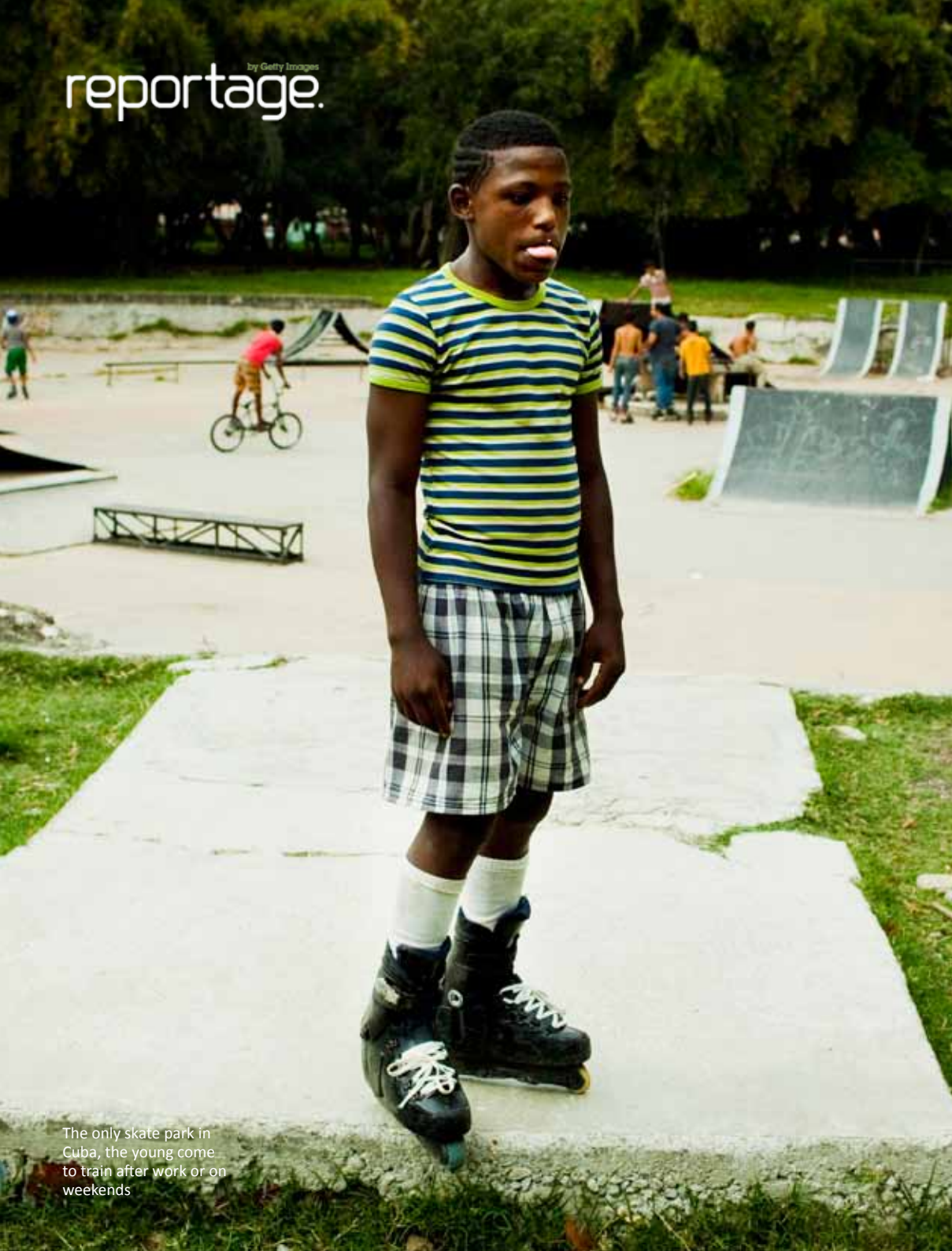
The only skate park in Cuba, the young come to train after work or on weekends