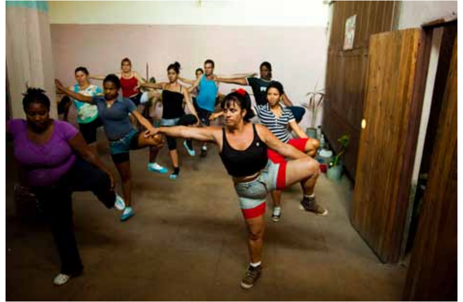
As part of a national public health program, the Cuban government has set up fitness classes to fight against obesity.